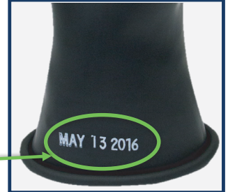
Exact Test Date